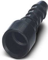
Pneumatic socket, for HC-M-PN3 module, internal hose diameter of 4.0 mm

Please be informed that the data shown in this PDF document is generated from our Online Catalog. Please find the complete data in the user documentation. Our General Terms of Use for Downloads are valid.